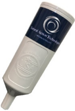
1a. Portable Unit Gray - $299

Just pour a liquid or beverage through the funnel end of the unit into a glass container to structure that liquid. Can be used to structure water, coffee, tea, coffee, wine, etc.