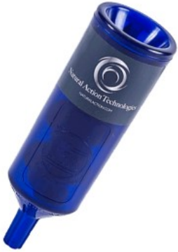
1. Portable Unit Blue - $349

Here are the NAT products that you can purchase from us. Use discount code NAT10 for 10% off!