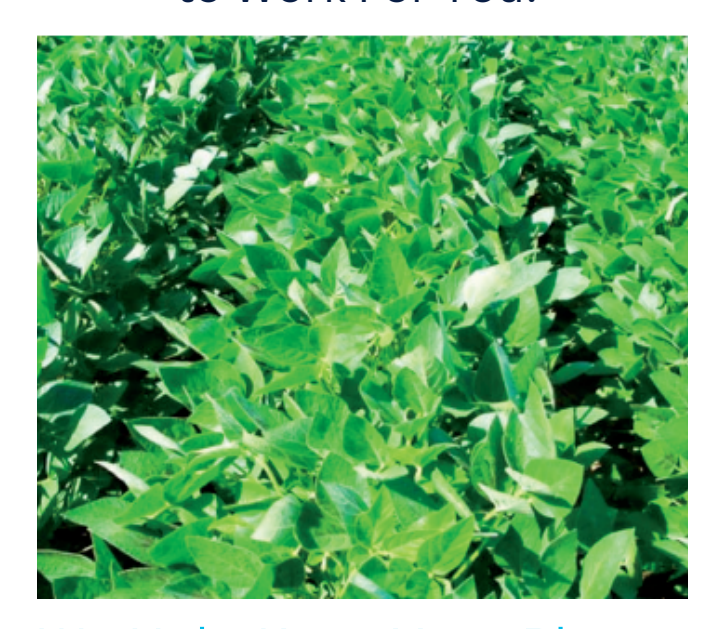
We Help Keep Your Plants Strong & Healthy

Call Us Today & Let Us Put SAS (Soap Adjuvant Surfactant) as Plant & Animal Wash to Work For You!