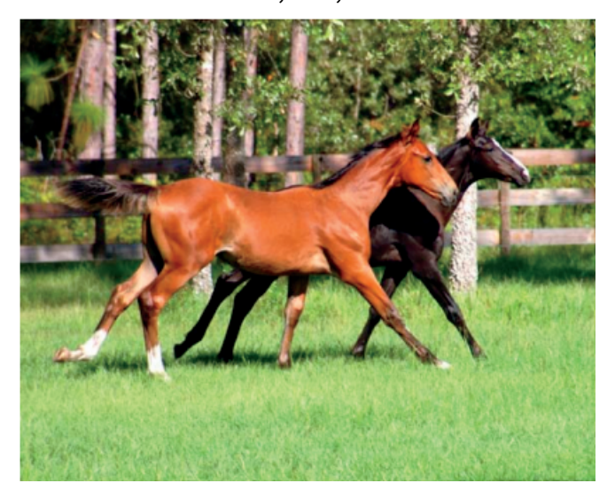
Will not harm animal's eyes, ears or respiratory system.

Can be used for cleansing open wounds. Can be used as a shampoo. Creates a healthy animal coat that "shines" when applied. Helps to rid animal of external pests such as ticks, fleas, lice, etc.